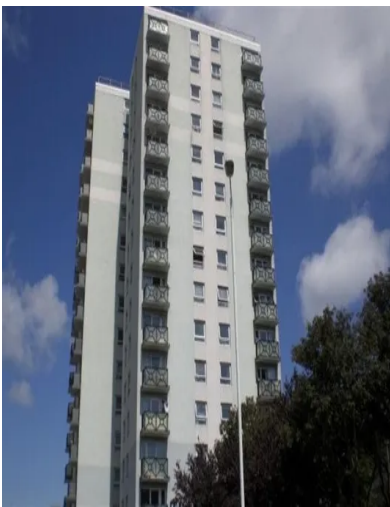
Kennedy House, Newcastle Hill, Ramsgate