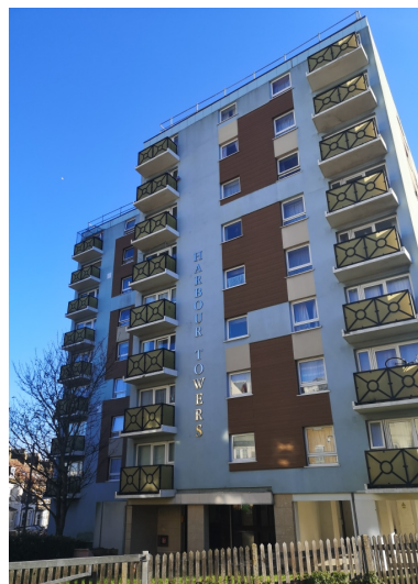
Harbour Towers, Hertford Road, Ramsgate