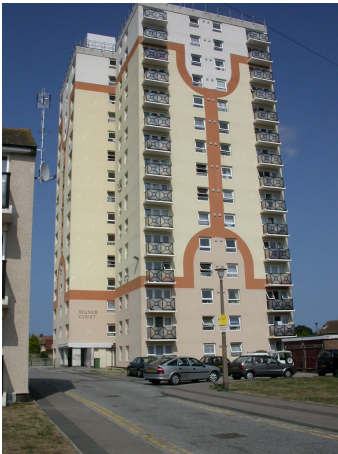
Staner Court, Manston Road, Ramsgate