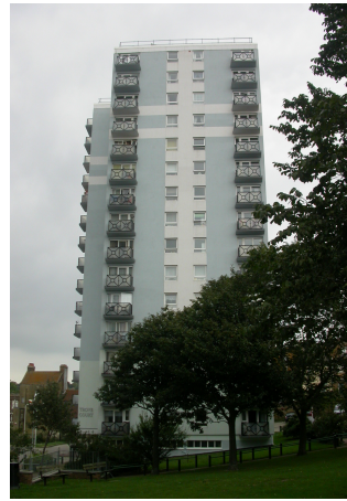
Trove Court, Newcastle Hill, Ramsgate